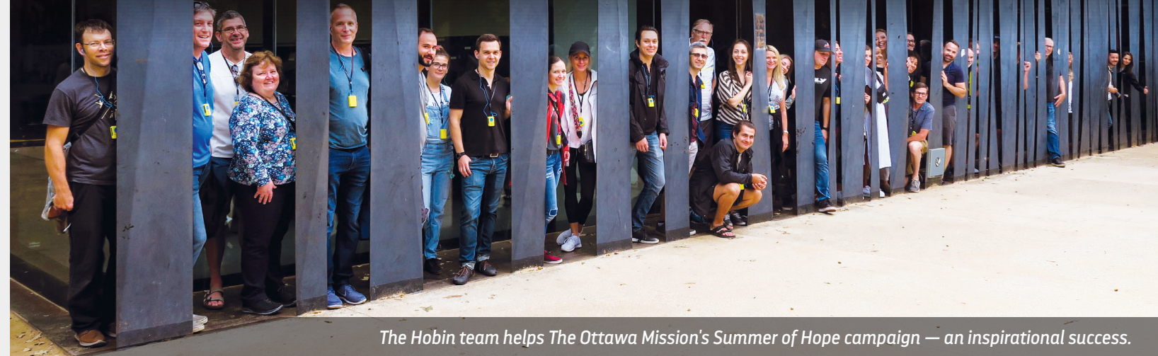
The Hobin team helps The Ottawa Mission's Summer of Hope campaign — an inspirational success.